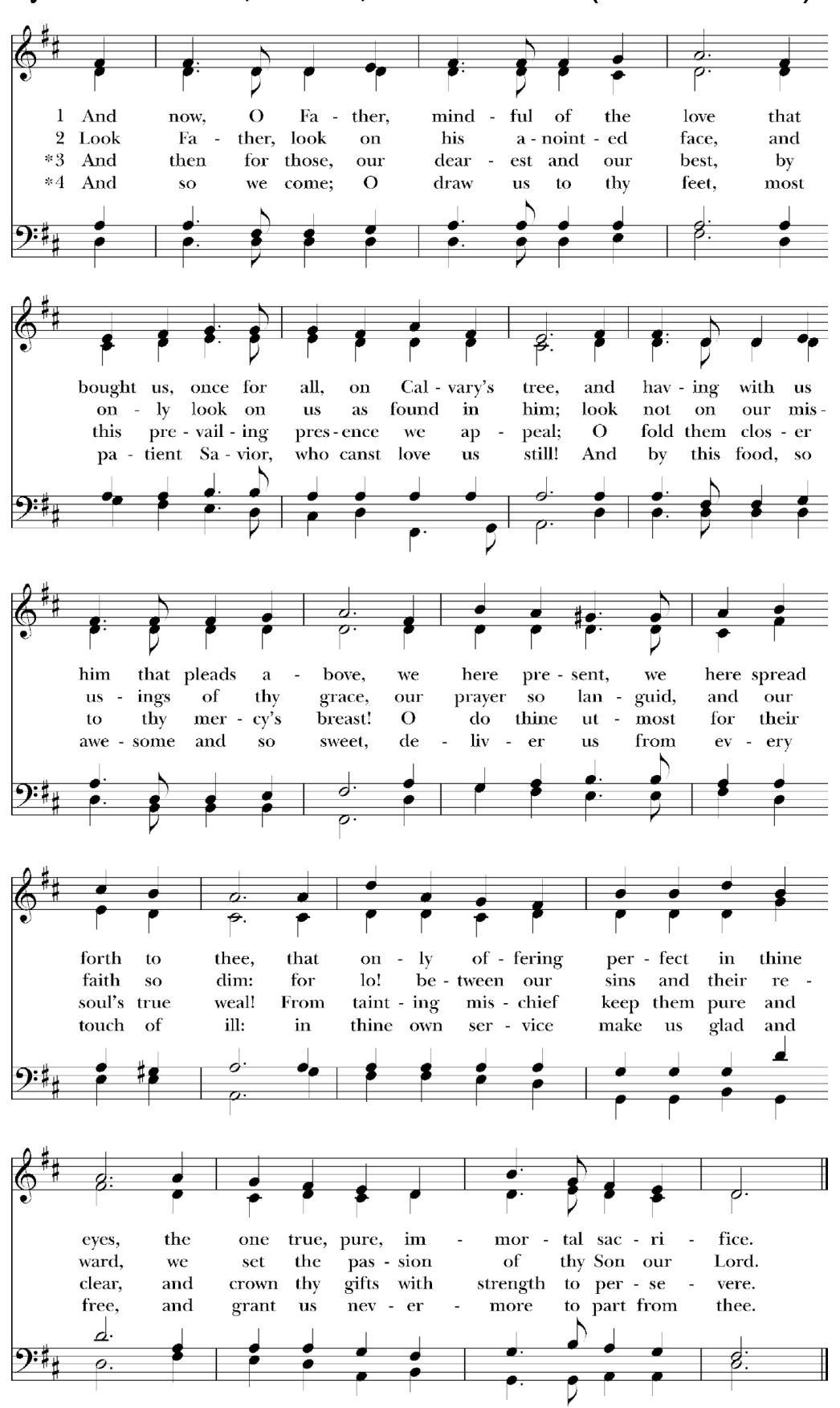
Hymn 337 – And now, O Father, mindful of the love (Unde et memores)