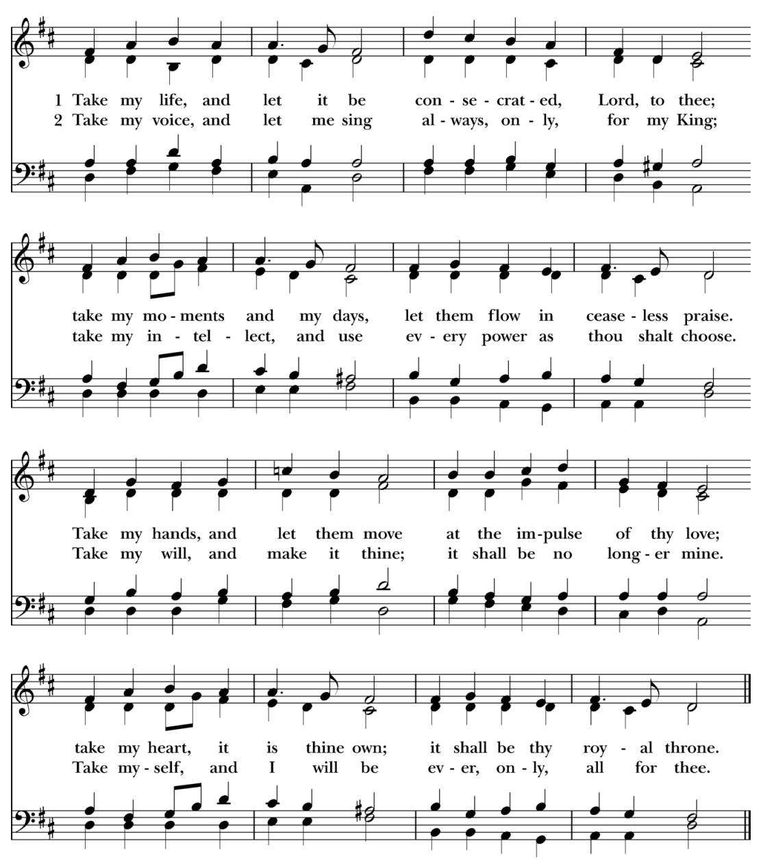
Hymn 707-Take my life, and let it be (Hollingside)