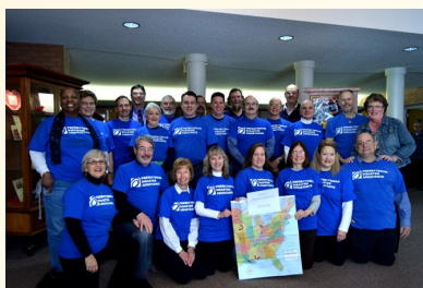
Rosedale Gardens Presbyterian Church has been active in volunteering with PDA participating in 11 trips in ten years.

On Sunday February 21, please wear something blue for Blue Out Sunday even though we are not physically gathered together in the sanctuary. This is a testament to one of the ways One Great Hour of Sharing makes a difference and recognizes the vital work of Presbyterian Disaster Assistance (PDA). We also ask you to consider supporting the ministry of Presbyterian Disaster Assistance through your financial gifts, action and prayers. If you would like to contribute to the OGHs special offering, you may send a check written to Trinity Presbyterian Church and designate "OGHS" in the memo line or go to our website, www.trinitypresbyterian.net/give . Thank you for your support!