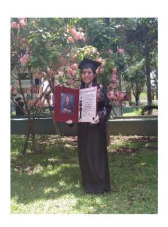
I will forever be grateful to each of the people who contributed to my life project.