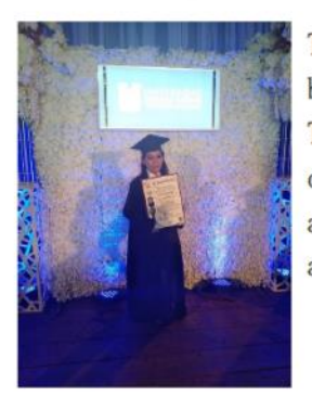
Thank you very much brothers from Wichita-Topeka for your support during all these years and for helping us to achieve our dreams.