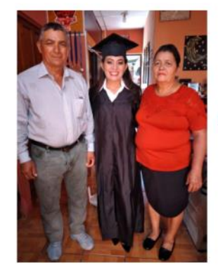
My parents accompanying me on this day so important to me