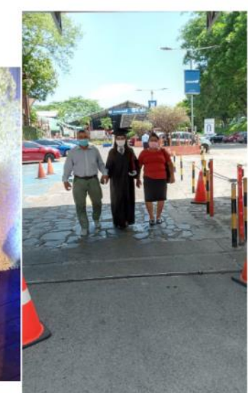
Leaving of the university with my parents