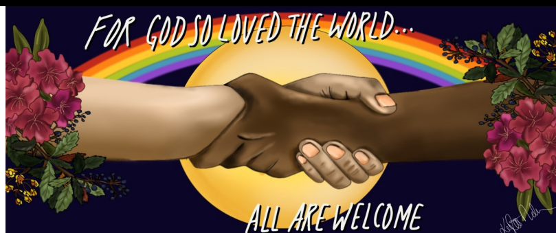
Final Mural Design