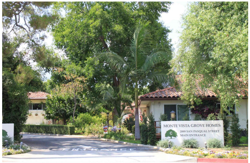
Main Entrance to Monte Vista Grove Homes

Here at Monte Vista Grove Homes (MVGH) we have seen the truth of Paul's words lived out. Our faith has been encouraged and expanded as we have listened to the stories of those who have served God in so many parts of the world. Besides the opportunities to worship in a variety of local congregations, weekly prayer groups, convocations, and conversations at meals have helped us to appreciate more what the faith - that has been so important to both of us all of our lives - has meant to others in so many different places. At the same time, we have had the opportunity to continue putting our faith into practice with many volunteer opportunities to serve others both here on our campus and through local churches and presbyteries.