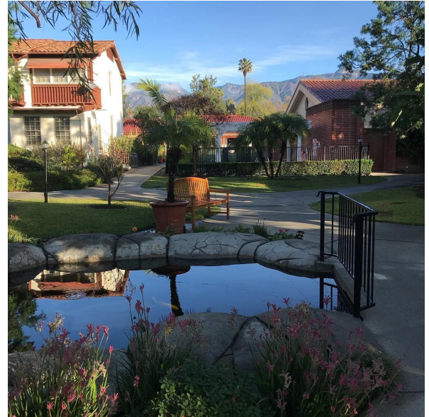
Koi Pond at MVGH