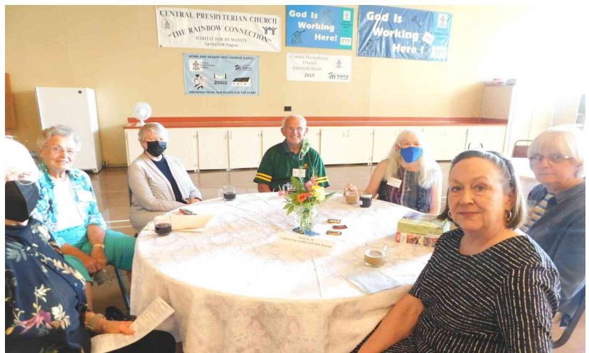
A Typical Table at "Meet Your Deacon Sunday"

I now have to make five new name tags for people who asked to have a Central name tag following this event. Praise be to God!