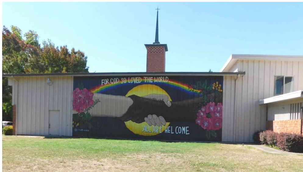
Mural on the East Side of Central Presbyterian Church

Central's long awaited mural was completed in late August, and the mural was dedicated following worship on Sunday, August 29 th , 2021. The mural is certainly a good first step in reminding folks that Central Presbyterian Church is here, and all are welcome. Many of our members have pointed out that it has started conversations with neighbors and friends about the church. The new mural is providing an opportunity to share the story of Central, and turn that into an invitation for those who are looking for a community of faith.