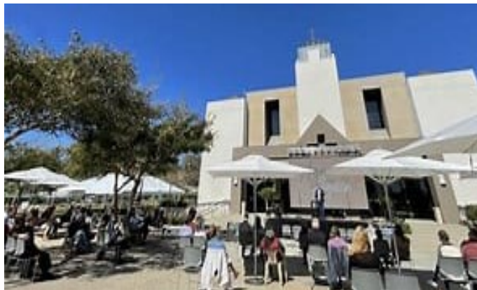
SOLANA BEACH PRESBYTERIAN CHURCH

"God is just and will not forget your work and the love you have shown as you have helped others and continue to help them."