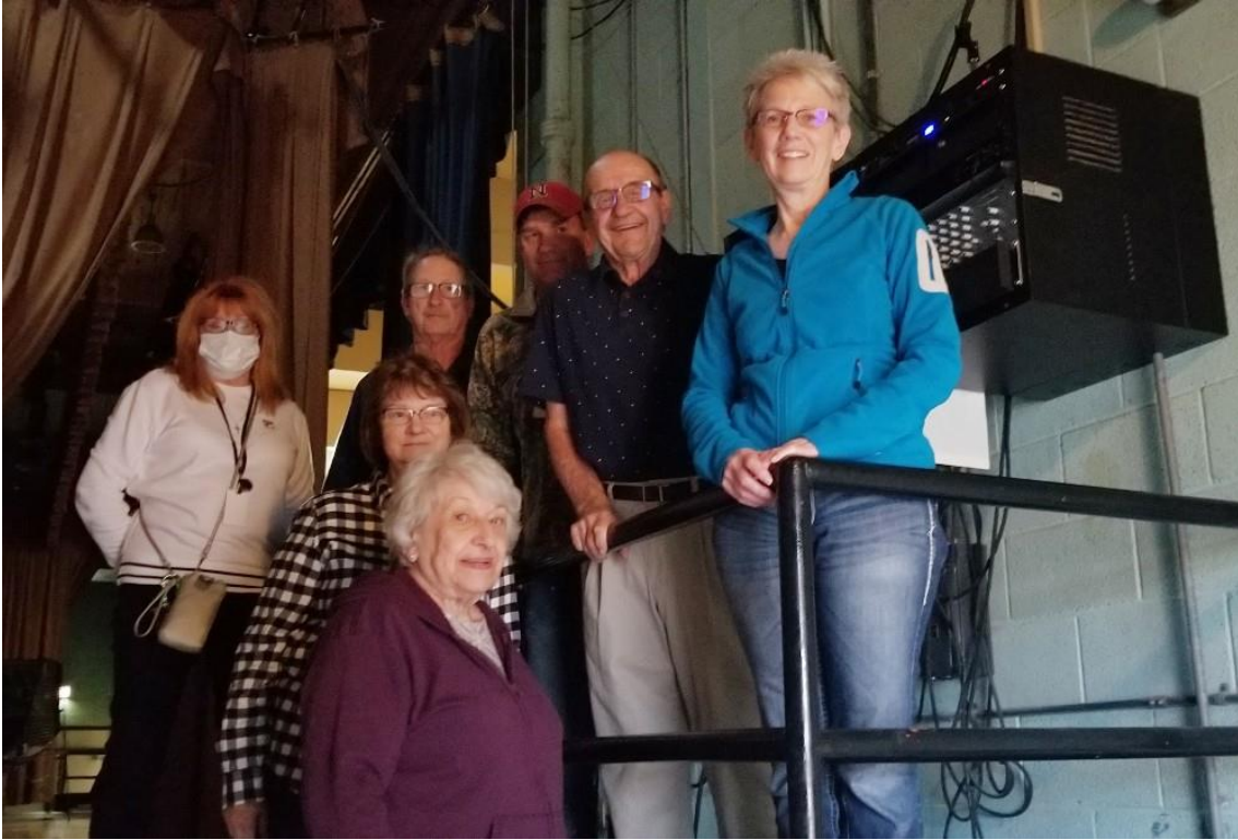
Pictured are Lodgepole Community Fund Advisory Committee Members in front of the newly updated sound system control panel at the Panther Activity Center (PAC)