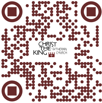
ELW 765 Lord of All Hopefulness