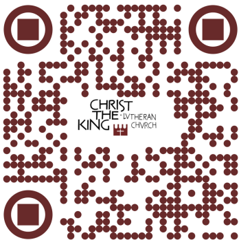
ELW 571 O Trinity, O Blessed Light