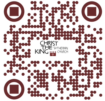
ELW 883 All People That on Earth Do Dwell