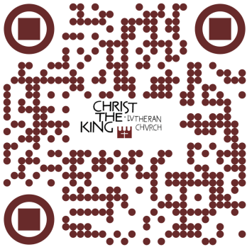
ELW 558 Lord God, we praise you