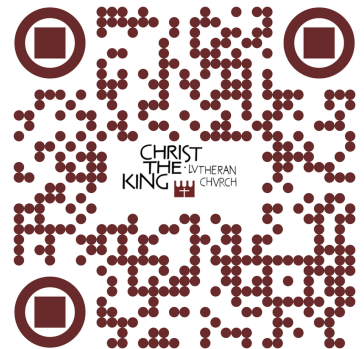
ELW 568 Hymn Now rest beneath Night's Shadow