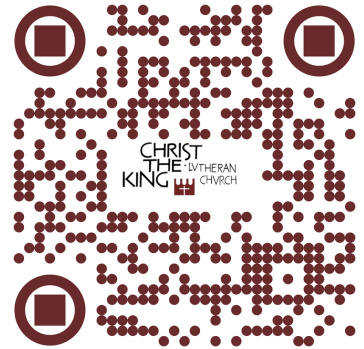
ELW 556 Morning Has Broken