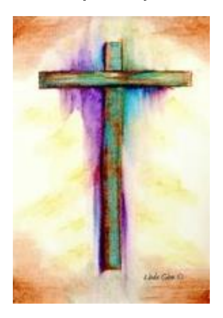
The Fourteenth Sunday After Pentecost Holy Eucharist, Rite II August 29, 2021