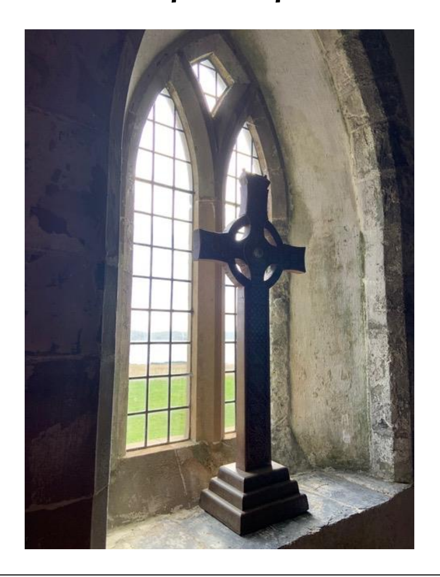
The Sixteenth Sunday After Pentecost Holy Eucharist, Rite II September 11, 2021