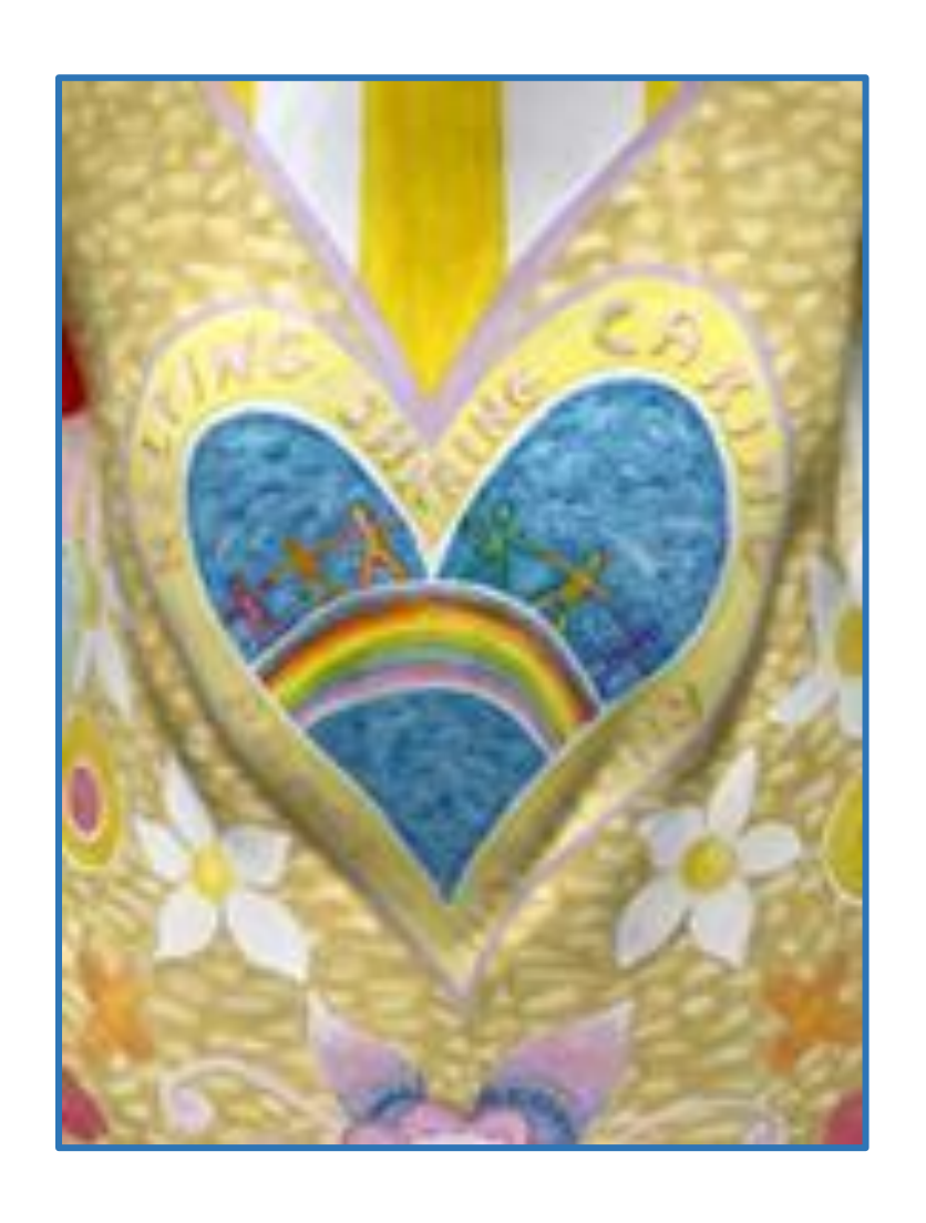
The Third Sunday after the Epiphany January 23, 2022