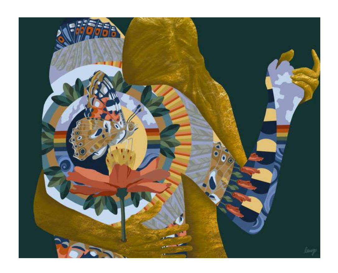
The Fourth Sunday in Lent March 27, 2022