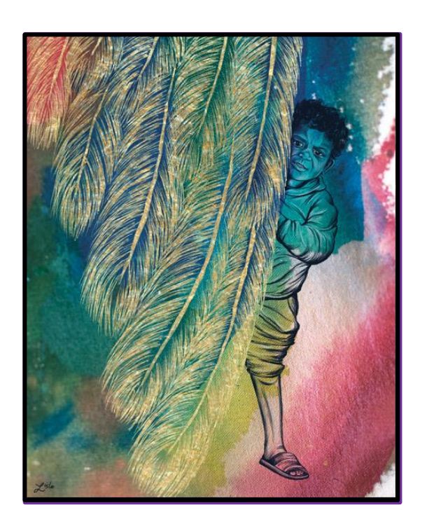
The Second Sunday in Lent March 13, 2022