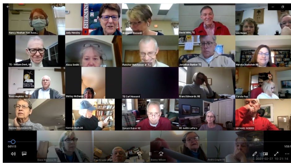
One screen from the Zoom Stated Meeting. We had 113 in attendance!