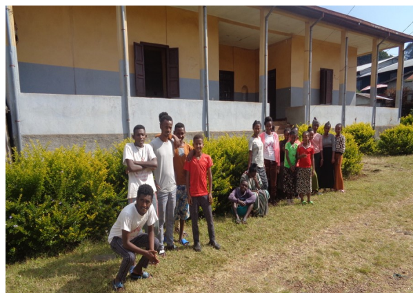
Here's a recent photo of some of the children, taken at the Gore Home.