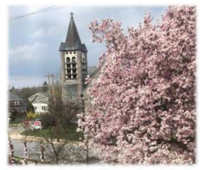
It is a beautiful, unique landmark of this community that defines this geographic place. It deserves to be preserved.