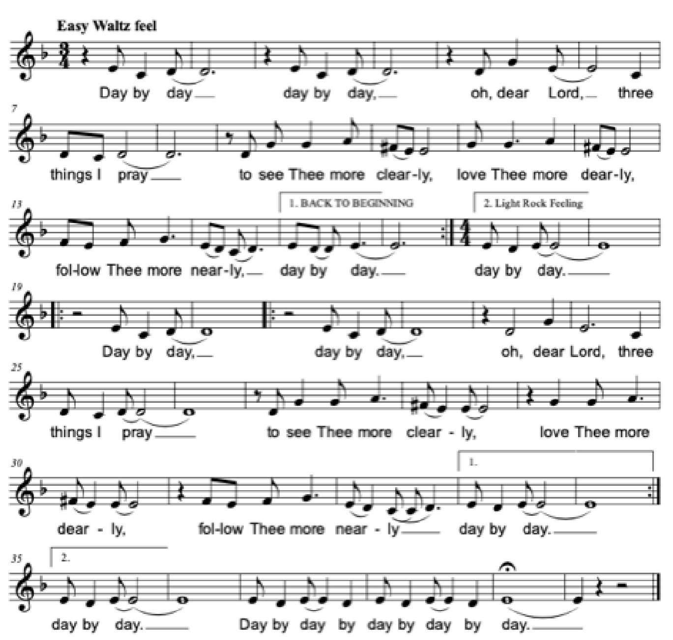
Copyright © 1971 Range Road Music Inc., Quartet Music Inc. and New Cadenza Music Corporation. Used by permission of Hal Leonard Publishing Corp. One License #A-701897