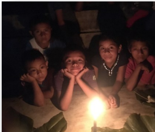
La Israel's children dreaming of a future